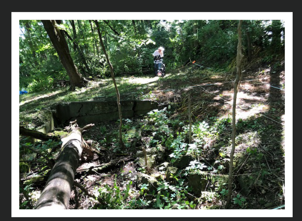
Overview of basement foundation within the Shell Expert's Cottage in 2020, facing west.