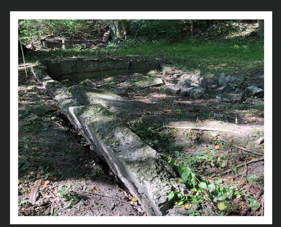
Overview of basement foundation within the Shell Expert's Cottage in 2021, facing west.