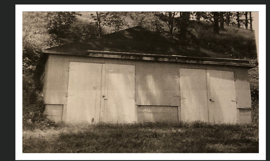
Overview of garage assigned to Superintendent's Cottage in 1941, facing north.