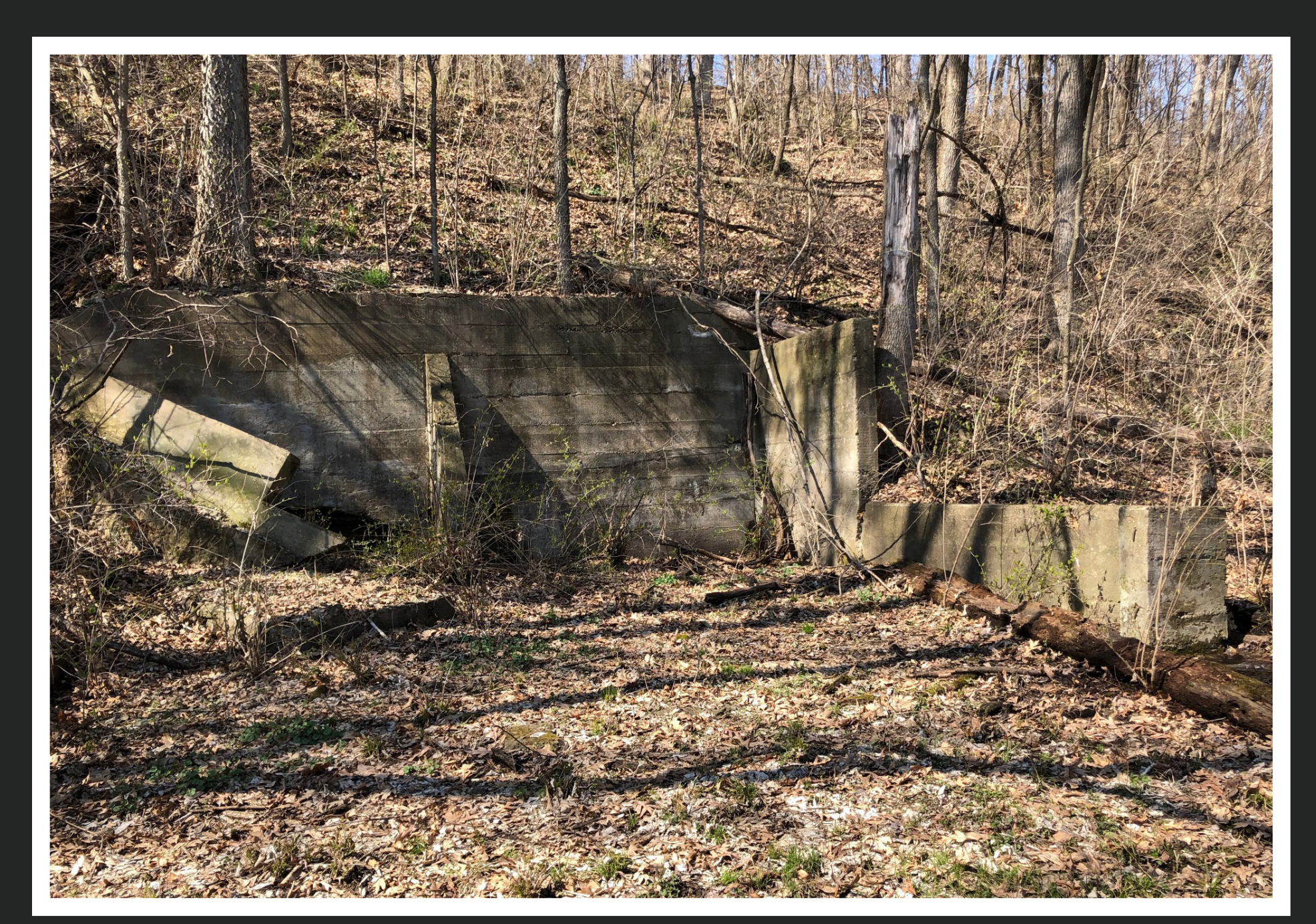
Overview of garage foundation next to Shell Expert's Cottage in 2020, facing northeast.